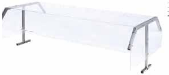
Model DSN63 shown.