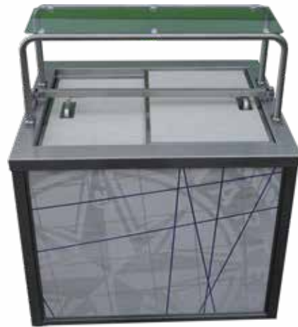
Display Over Shelf Single Glass as shown on C4 Refrigerated Speedline Cabinet

The glass is 1/4" tempered glass with polished edges. Glass is attached to 1-1/2" round stainless steel tubing. The Over Shelf is then top-mounted to top of the cabinet.